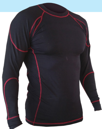
Long sleeves t-shirt Ref. SAHO