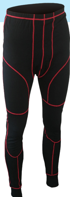
Long underpants Ref. SABA