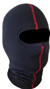
Hood Ref. SAGA